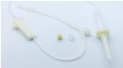
Penetration Plugs and Buttons for Infusion set