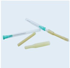
Penetration Tube for Infusion Set