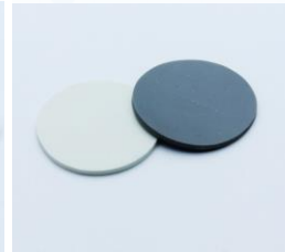
Sealing rubber for Rectal Administration Sets