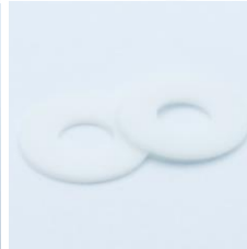
Needle Head Lock for Glass Syringe