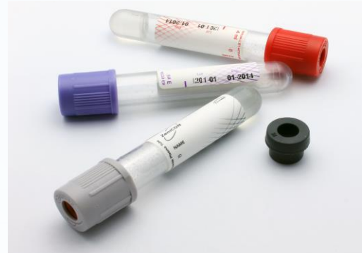
Rubber stoppers for blood collection tube

Our medical-grade products are integrated into various medical and analytical devices, including infusion sets, vacuum blood collection tubes, etc.